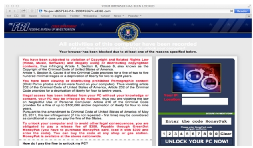
Malwarebytes Unpacked – Jerome Segura

The ransomware is pushed to victims' computers when they browse common websites, specifically when they query popular search terms. Once the web browser is exploited, the victims' computer displays a pop-up warning that appears to be from the FBI. Cyber criminals use "FBI.gov" within the URL to make the warning appear more legitimate.